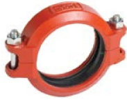
1 – 8"/DN25 – DN200